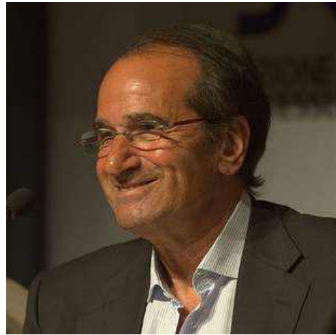
Jean Paul Fitoussi